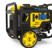
skyVac® 3600 Watt Inverter