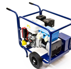
skyVac® 5KVA Petrol Generator