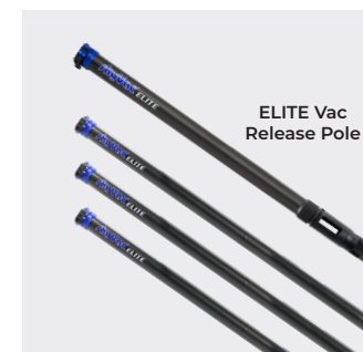
ELITE Vac Release Pole