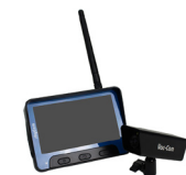
skyVac® 'Real-Time' Inspection System