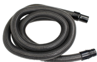
7.5M Reinforced Hose