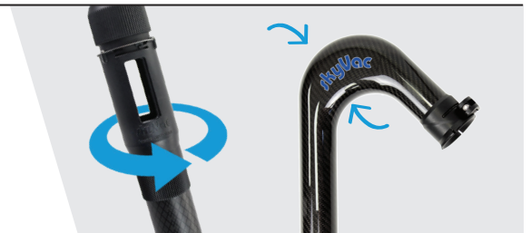
Vac Release Cuff