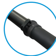
Carbon Fibre / Fibre Glass Hybrid