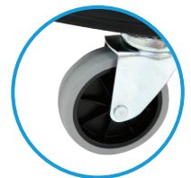
4 x Multi Dircional Castor Wheels