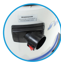
Cyclonic Side Entry Port