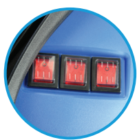
3 Powerful Motors