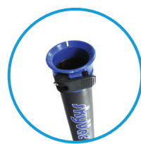
Carbon Fibre Poles