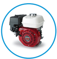
Onboard Honda Motor