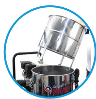
Optional Sieve Basket