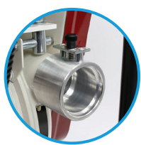
Blow Function Feature