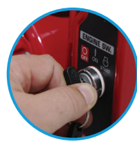
Optional Key Start