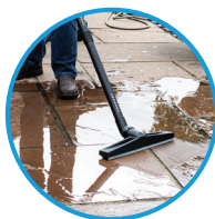
Water Pick Up