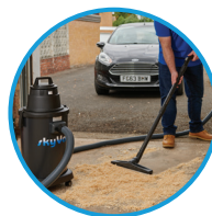
Dirt & Rubble Clearance