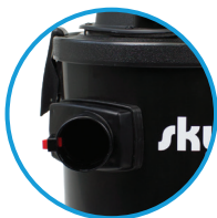
Cyclonic Entry Port