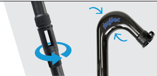
Vac Release Cuff