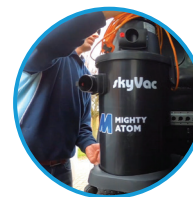
Lightweight & Portable