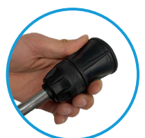
Adjustable Fan Lance