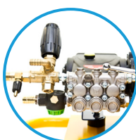
Adjustable Pressure Regulator